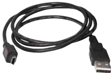
EA-A02-002 Power Supply